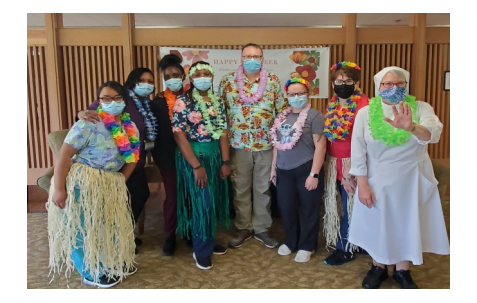
CNA Week - Luau Day